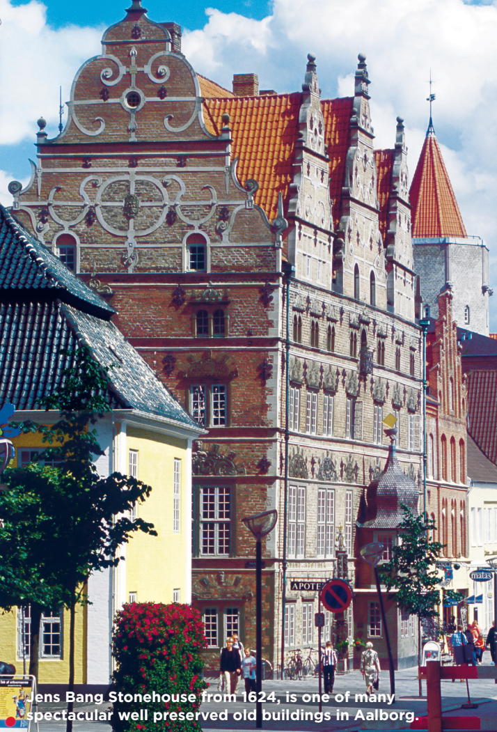
Jens Bang Stonehouse from 1624, is one of many spectacular well preserved old buildings in Aalborg.